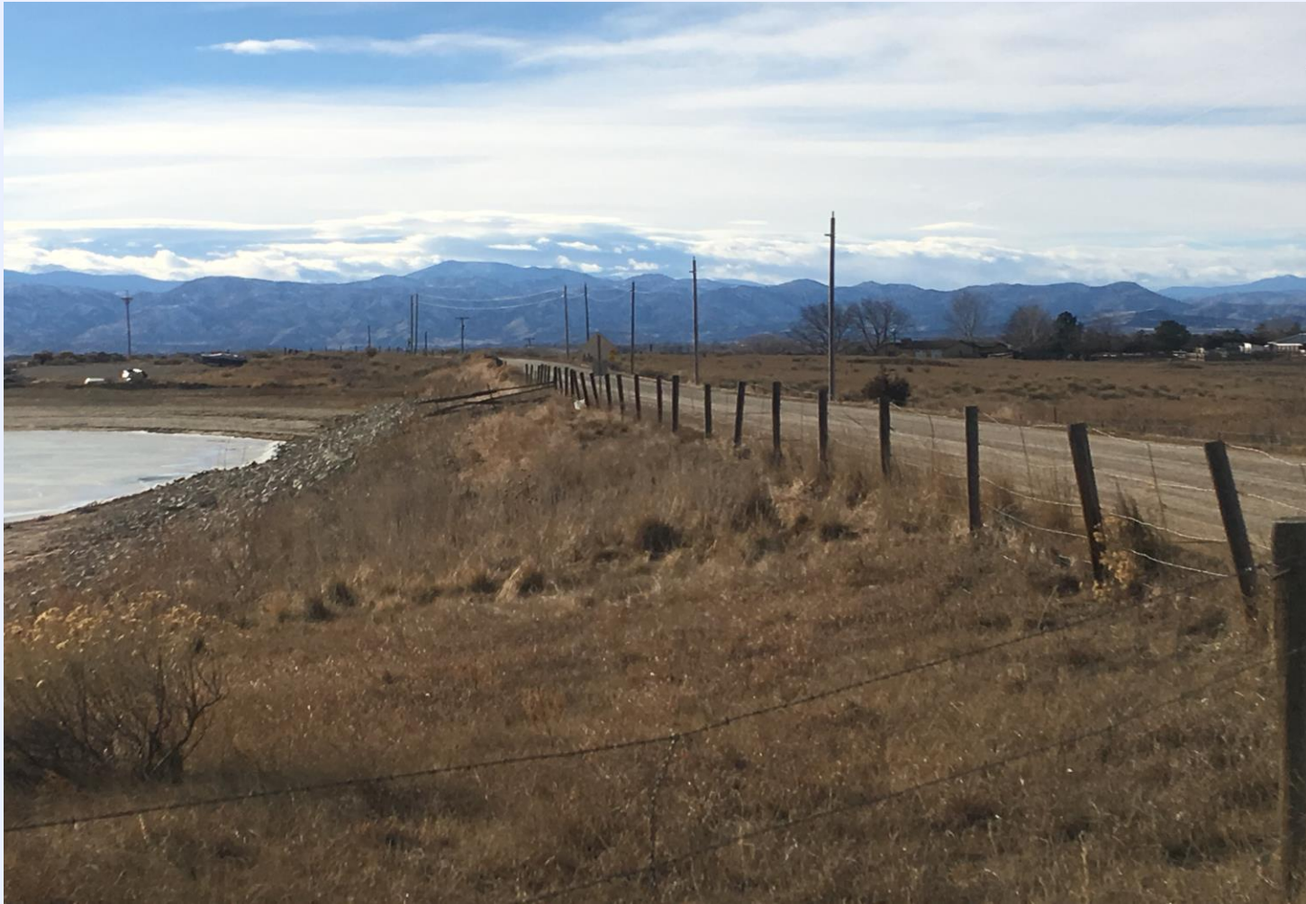
Cobb Lake Northern Shore and CR 56