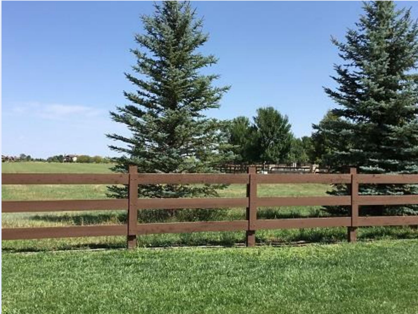
Open Space and Nature