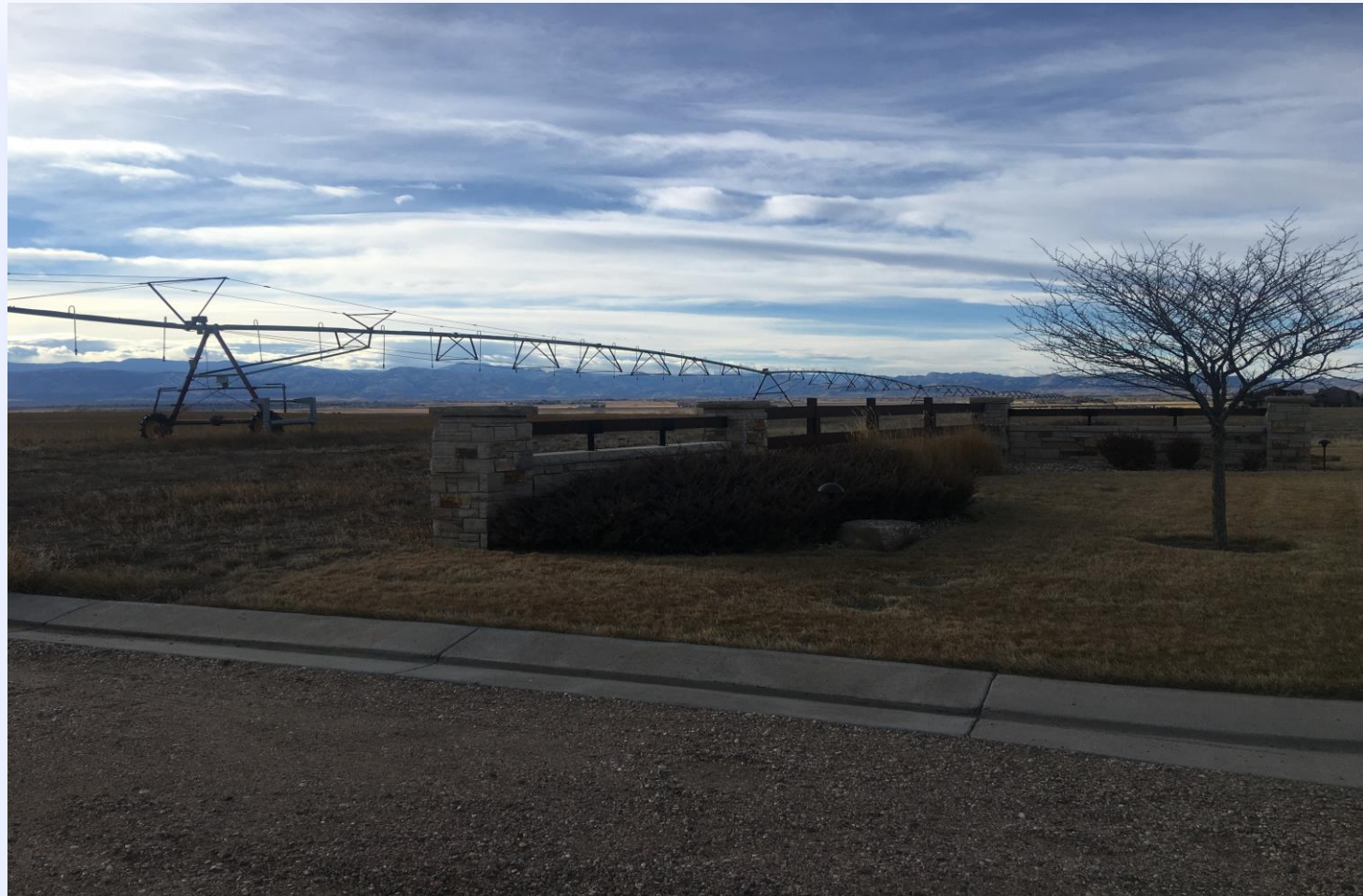
Agriculture at The Hill