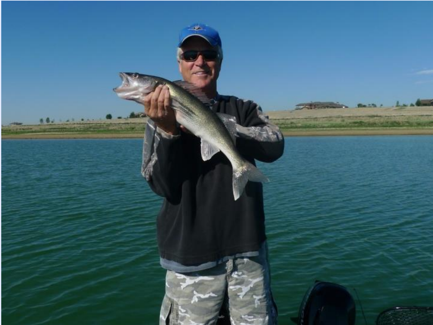
Catch and Release Trophy Walleye Fishery