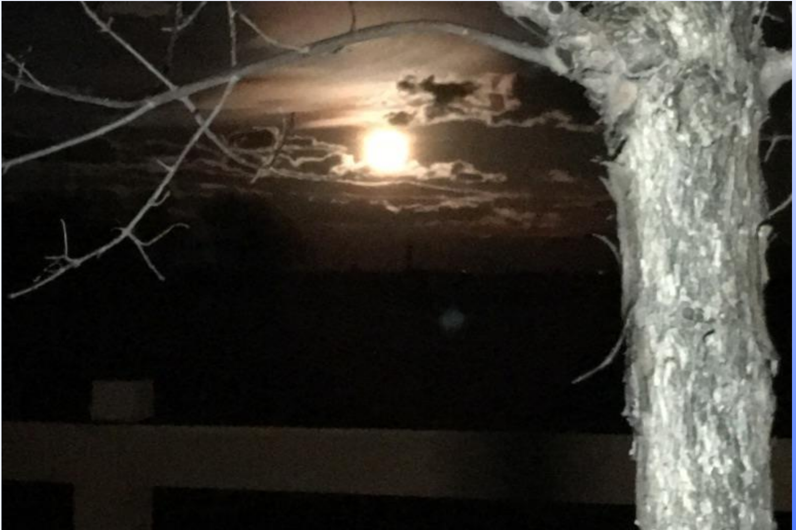
Serenity and Quiet