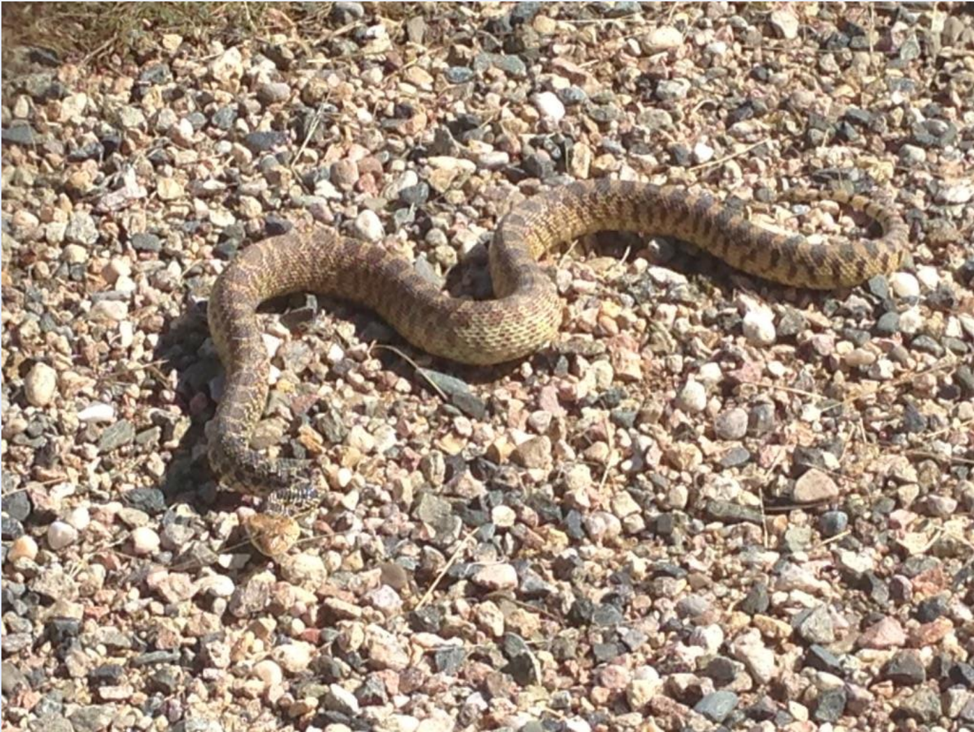
Healthy Population of Rattlesnakes along CR 56