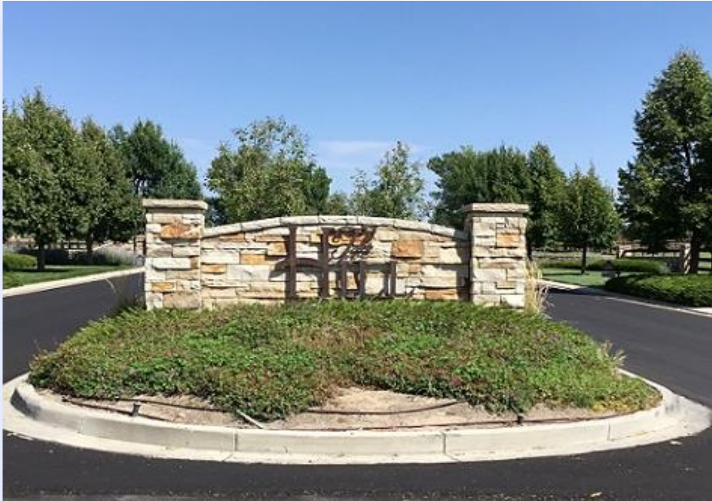
The Hill Community