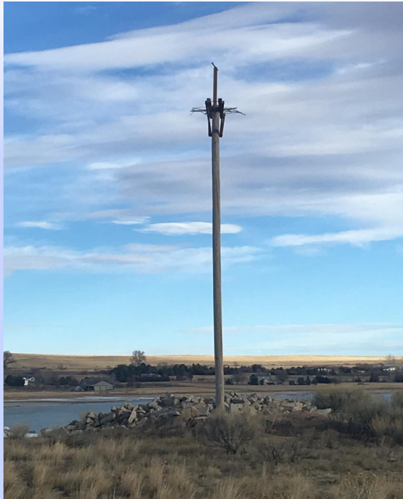
Osprey Nesting Site along CR 56