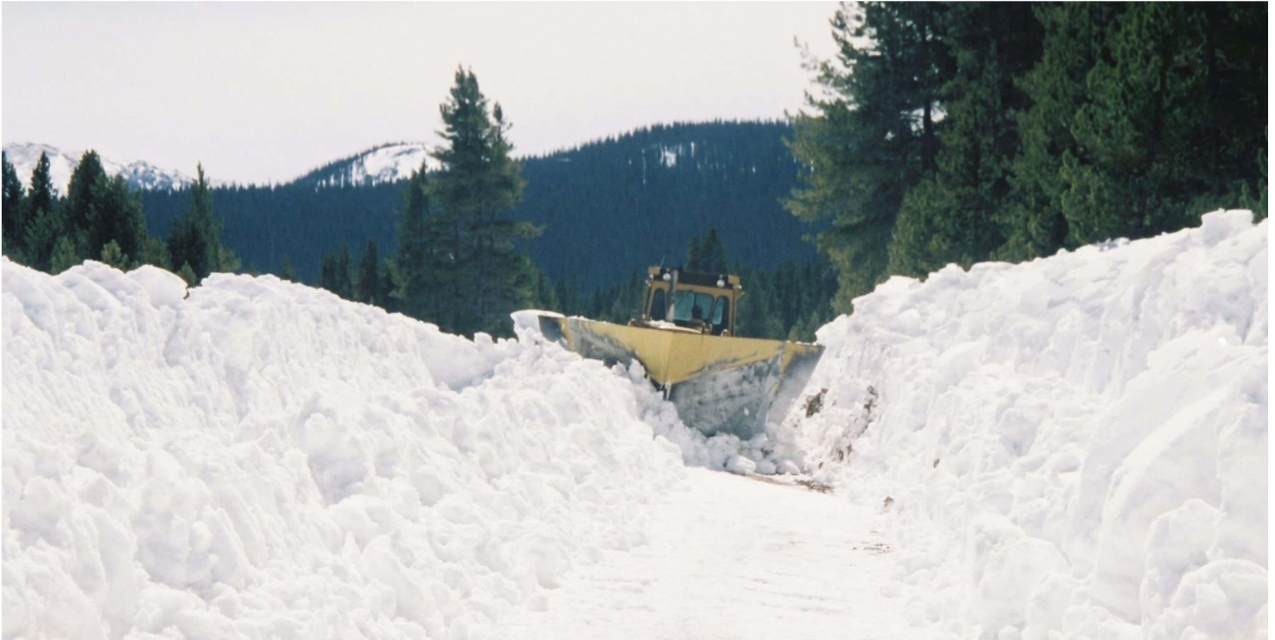
Cat D7 on Long Draw Road