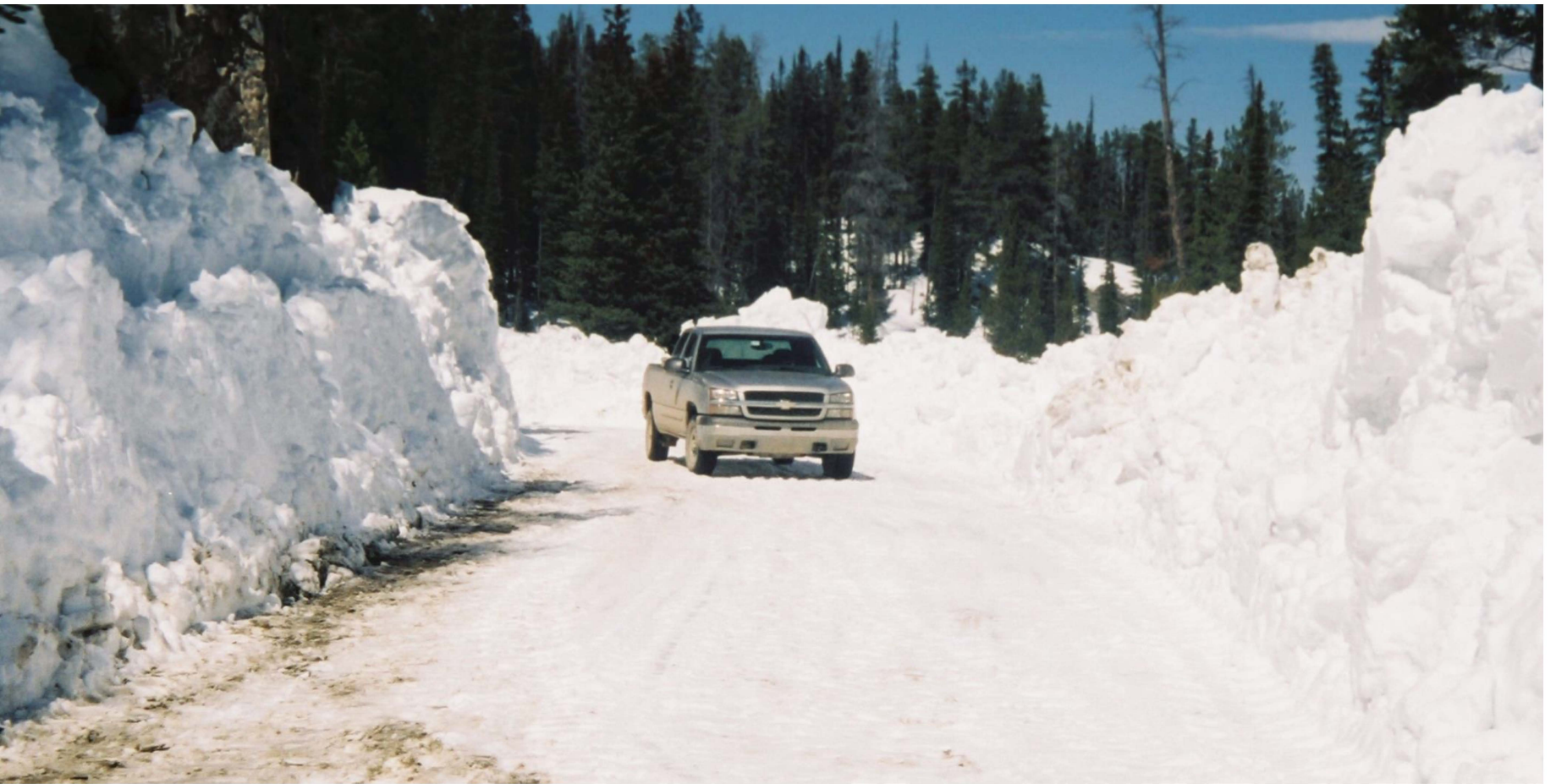
“Big Drift” – Corral Park