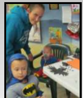
Special drop-in events such as "Haunted Halloween" provide fun and learning for all ages. (below)

Community volunteers are vital to our educational efforts, and in helping us maintain a safe and attractive environment for learning.