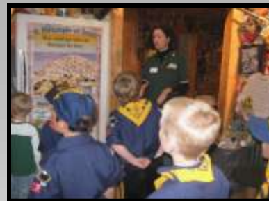
Cub Scouts visit and learn more in order to meet requirements for their recycling badge. (left)

Through on-site visits and outreach to schools, service organizations and other groups of all ages, as well as at community events, our educational efforts reach thousands of people each year.