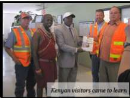
Kenyan visitors came to learn