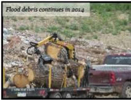
Flood debris continues in 2014