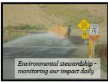
Environmental stewardship - monitoring our impact daily