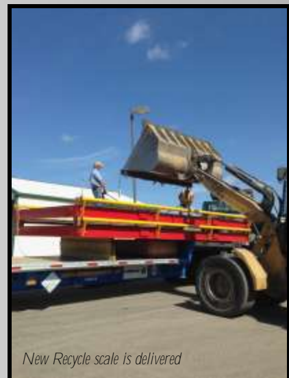
New Recycle scale is delivered