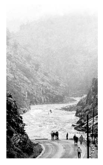
Hwy 34 after the Big Thompson Flood, August 1, 1976